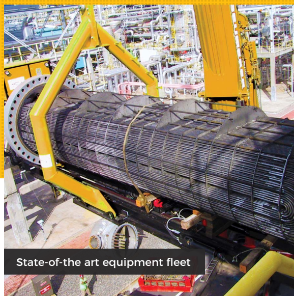
State-of-the art equipment fleet

USA DeBusk streamlines heat exchanger turnarounds with true blind-to-blind service, maximum efficiency and consistent quality. From pre-turnaround planning to bolting the final bundle, USA DeBusk provides full project management, execution and tracking.